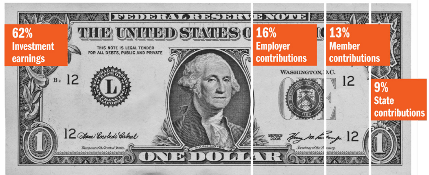
Figure 1: Sources of revenue to pay benefits for the last 30 years

Investment earnings are a critical component of the CalSTRS Funding Plan and the goal of reaching full funding by 2046. For the last 30 years, investment earnings have been the largest contributor to our ability to pay benefits (see Figure 1) and will continue to be. While benefit payments and contributions are predictable, short-term investment returns are more volatile due to normal market movements that can cause significant swings in portfolio return in any given year.