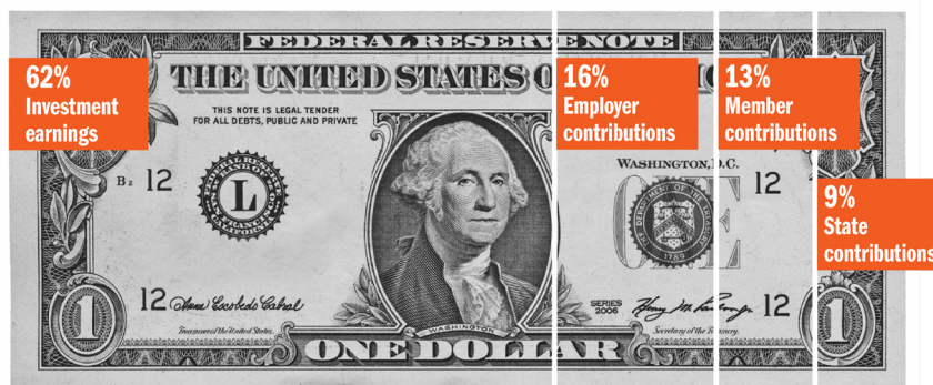
Figure 1: Sources of revenue to pay benefits for the last 30 years

Investment earnings are a critical component of the CalSTRS Funding Plan and the goal of reaching full funding by 2046. For the last 30 years, investment earnings have been the largest contributor to our ability to pay benefits (see Figure 1) and will continue to be. While benefit payments and contributions are predictable, short-term investment returns are more volatile due to normal market movements that can cause significant swings in portfolio return in any given year.