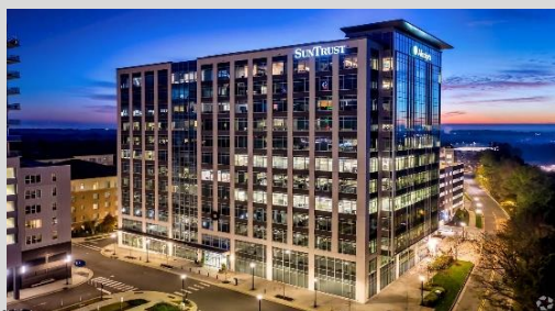
Midtown Plaza / 1710 Platte

Acquired in 2011, the ~440,000 sq ft regional open-air shopping center in Louisville, KY sold in Q4 2023. The property sold for ~$66 million, generating a 3.5% net IRR and a 1.24X net equity multiple.