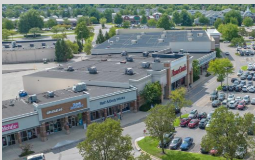
Springhurst Towne Center

Acquired in 2011, the ~440,000 sq ft regional open-air shopping center in Louisville, KY sold in Q4 2023. The property sold for ~$66 million, generating a 3.5% net IRR and a 1.24X net equity multiple.