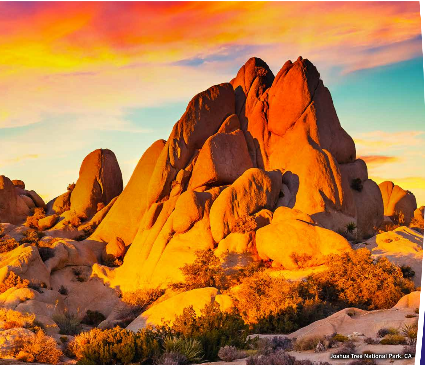
Joshua Tree National Park, CA