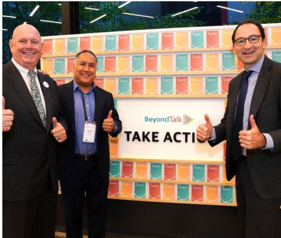
Industry (manager) engagement