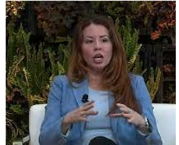
Portfolio (company) engagement