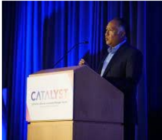
Industry (peer) engagement

2023 - Day One (Main stage) 2023 - Day Two (Main stage)